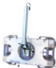
Arm with tilt and swivel function for B18DM4 lifting system