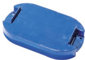
Additional counterweight, 25 kg