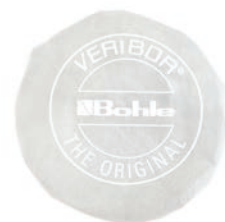
Protective cover for suction pads, ø 220 mm