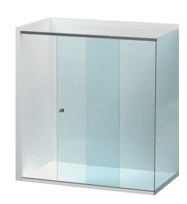
One-sided corner application