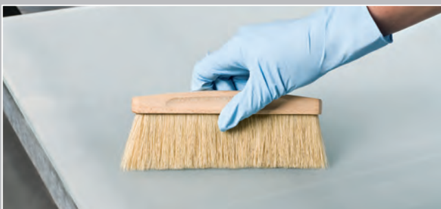
Cleaning the glass

If the coating of rough surfaces shows visible damages (so-called "clouds" or "streaks") due to improper or excessive use, it can simply be repaired by coating the surface again with BriteGuard® Surface Sealer X. Removing the old coating or sandblasting the surface again is not necessary.