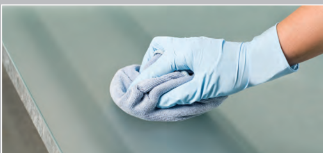
Distributing the material with a microfibre cloth