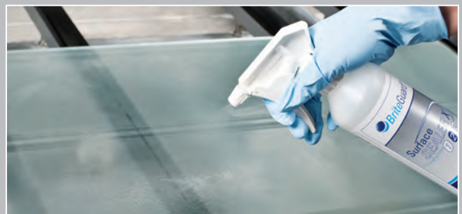
Application with the included spray head