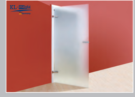
Sliding Doors Glass Doors