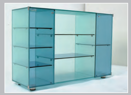
Furniture Glass Partitions