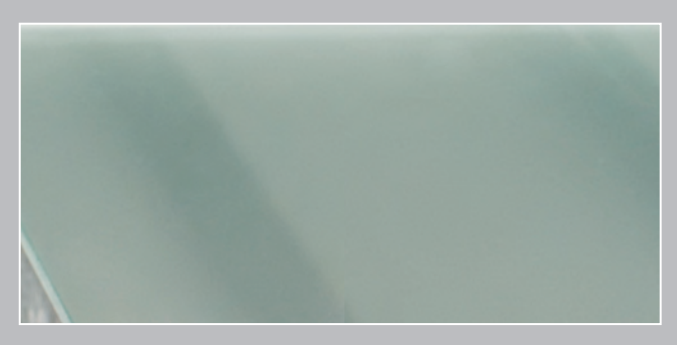
Resting time approx, 30 minutes