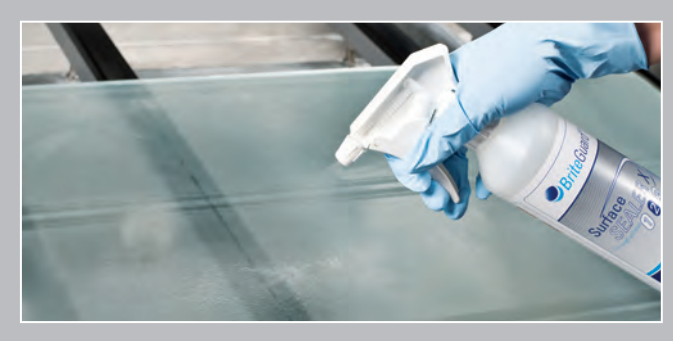
Cleaning the glass